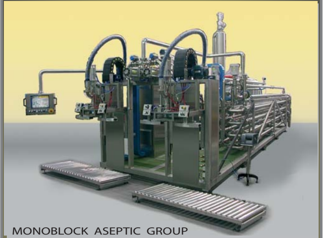
MONOBLOCK ASEPTIC GROUP