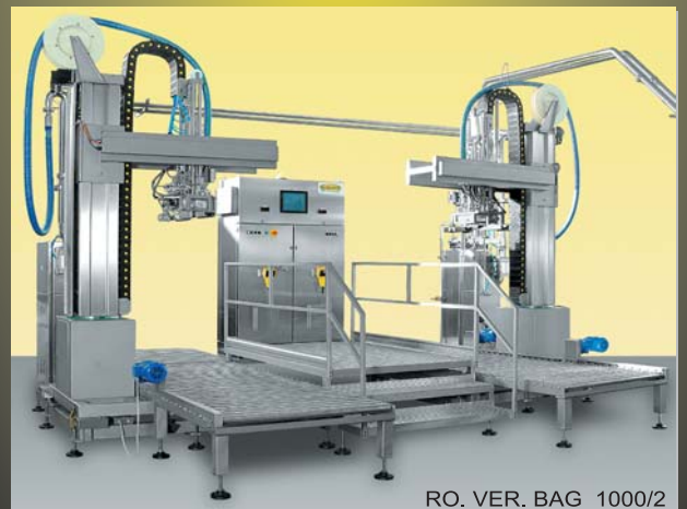
RO. VER. BAG 1000/2

Research and Technology for Your Process