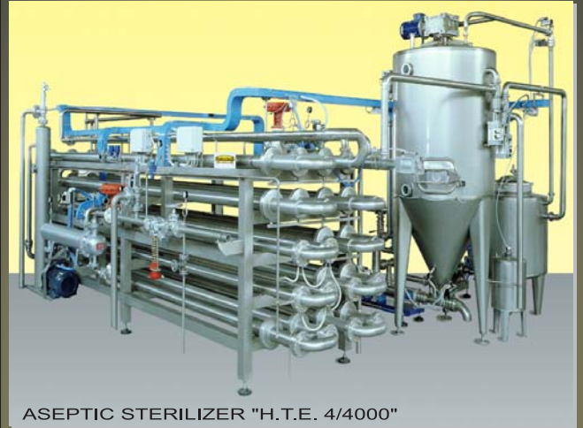
ASEPTIC STERILIZER "H.T.E. 4/4000"

Ricerca e Tecnologia per il Vostro Processo